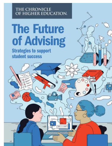
The Future of Advising