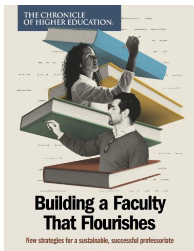
Building a Faculty That Flourishes